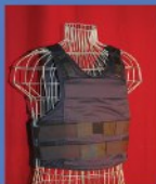
SCO/IIIA-1 –Value Body Armour Certified to NIJ Level IIA